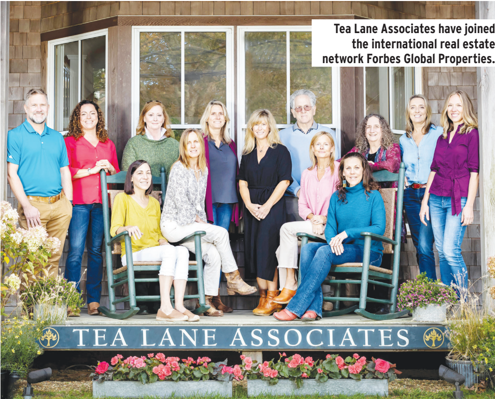
Tea Lane Associates have joined the international real estate network Forbes Global Properties.